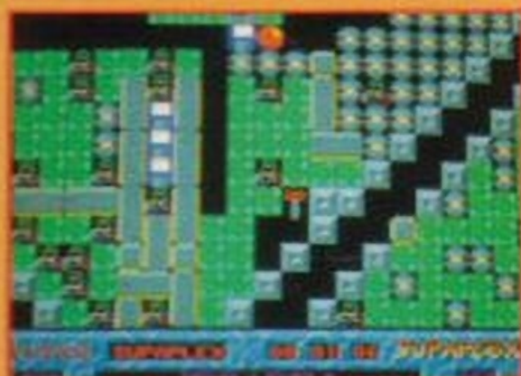
Screen shots from Amiga